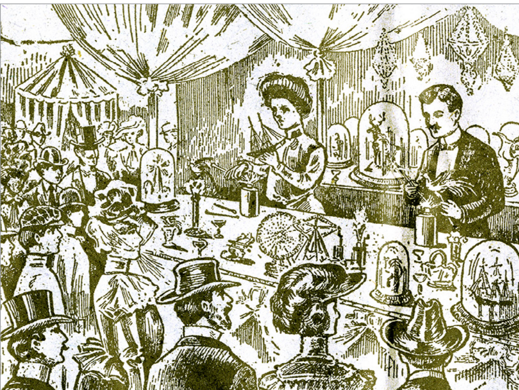
Detail from a pamphlet advertising a glass blowing exhibition, 1904, CMGL 131361.